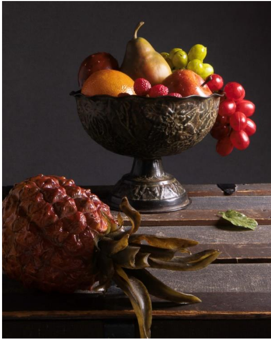
Video Light Test